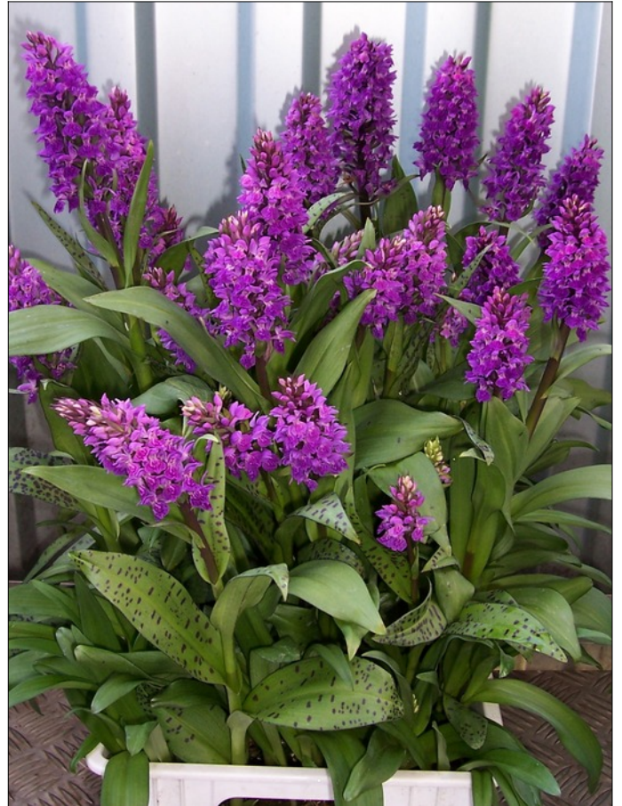
Dactylorhiza hybrids after uncontrolled pollination. The mother plant was a Dactylorhiza purpurella without spotted leaves.

Many of the Dactylorhiza plants grown in gardens are hybrids. This is because hybrids are often stronger and more fast-growing than pure species, a phenomenon called hybrid vigour, and therefore selected by the gardeners. Many gardeners, however, do not recognize that a large proportion of self-seeded Dactylorhiza found around the garden will be hybrids.