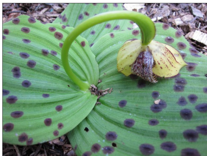
Cypripedium margaritaceum ssp. fargesii before pollination and a few days later.

inbreeding is selfing where the same plant is both mother and father, but selfing is the only option if you only have one clone of a species. In many cases, the offspring will be okay, but sometimes you do get seed of low genetic quality that may not germinate or may show abnormal development. Shown below is Orchis pauciflora with normal tubers and cell masses that multiplied