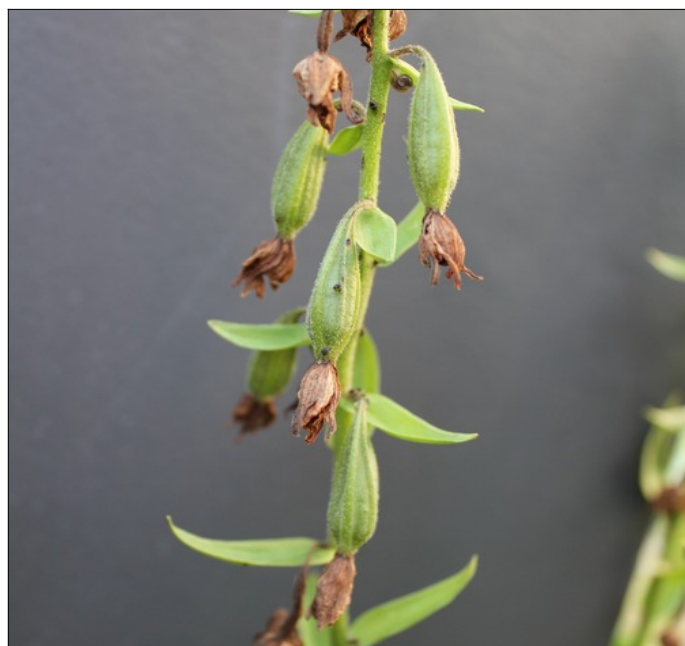
The Epipactis hybrid Passionata gx ( E. palustris alba x E. royleana ) is very fertile.