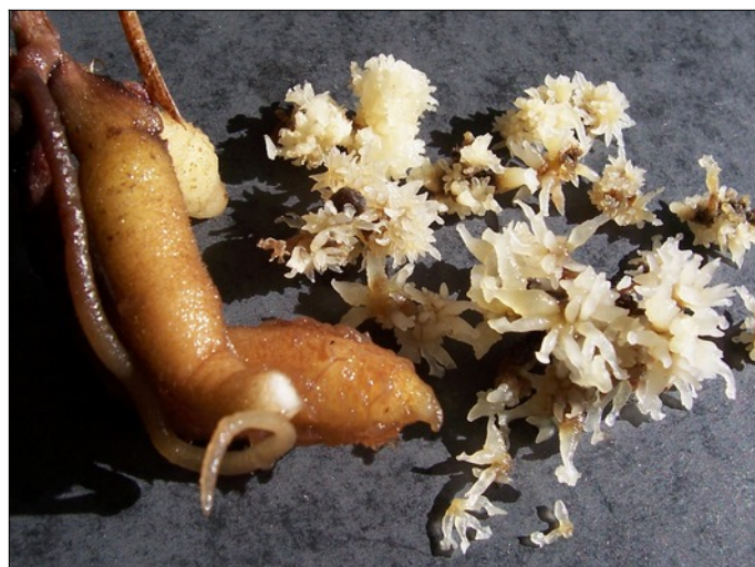
Abnormal growth of Orchis pauciflora seedlings (right) and normal development (left).

inbreeding is selfing where the same plant is both mother and father, but selfing is the only option if you only have one clone of a species. In many cases, the offspring will be okay, but sometimes you do get seed of low genetic quality that may not germinate or may show abnormal development. Shown below is Orchis pauciflora with normal tubers and cell masses that multiplied