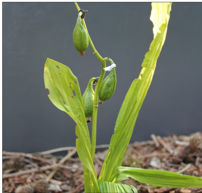
Calanthe tricarinata seed pods. The upper and lower pods were from selfed flowers, the middle was hybridized with Calanthe arcuata .

distantly related so that the chromosomes are too different giving problems with chromosome pairing during meiosis.