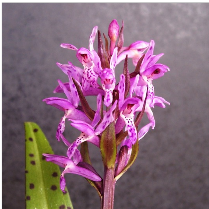
Dactylorhiza majalis seedling with genetic problems, most of the lip has vanished.

Inbreeding depression is caused by deleterious recessive genes that are expressed in higher frequency when plants are inbred. Below is a picture of a Dactylorhiza majalis seedling with a deletion of the lip. The parent plant had normal flowers with broad lips, but after selfing half of the seedlings looked weird. The genetic deformation of the flowers might have been avoided if two genetically different clones were cross-pollinated.