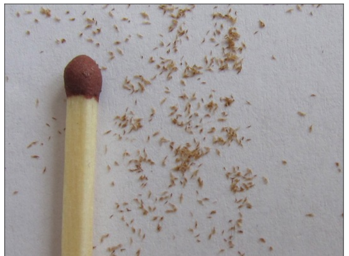
Orchid seeds are small, 0.1-1.0 mm. In nature, they cannot germinate without the help of specific fungi that provide sugars, minerals and other growth factors.

For short-term storage, dry the seeds at room temperature a few days wrapped in paper, and store them in the refrigerator in small, closed reagent tubes or Eppendorf caps. This way most species will remain viable for several months. For long term storage, store the dry seeds in Eppendorf caps in the freezer where the seeds remain viable for several years. The seeds do not like repeated freezing and thawing.