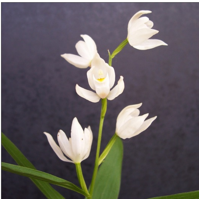
Cephalanthera longifolia before pollination.