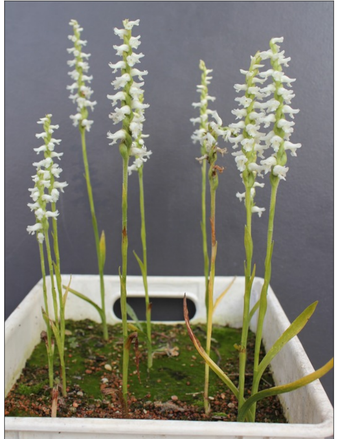
The same plants half a year later (October).