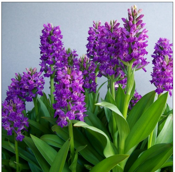
Dactylorhiza purpurella fourth year in soil. They are now ready for a humid spot in the garden.