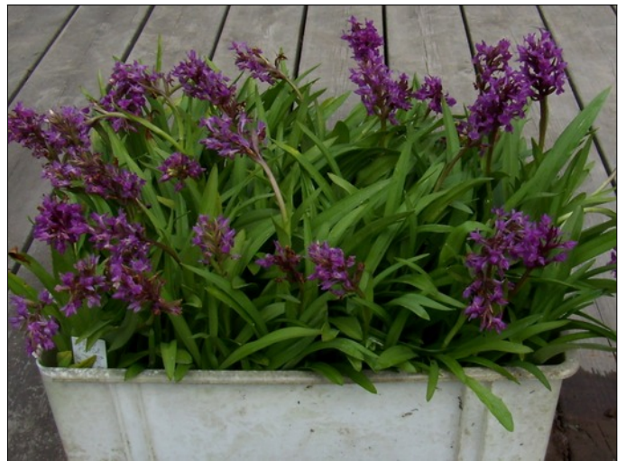
Dactylorhiza purpurella third year in soil. The box is far too crowded.