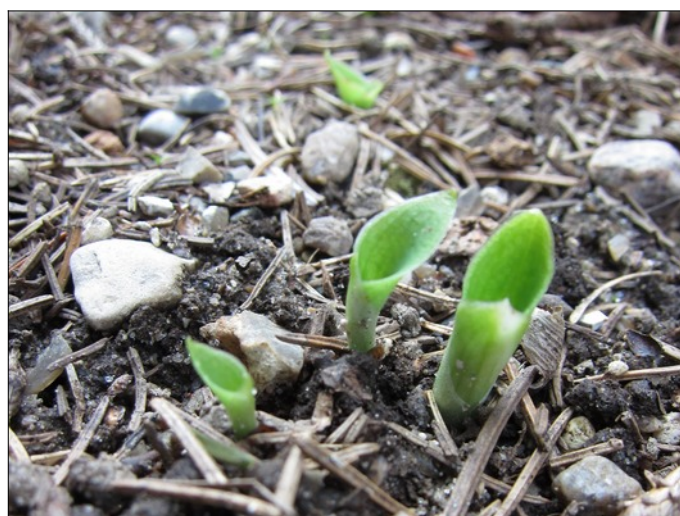
Satyrium nepalense seedlings in the garden.