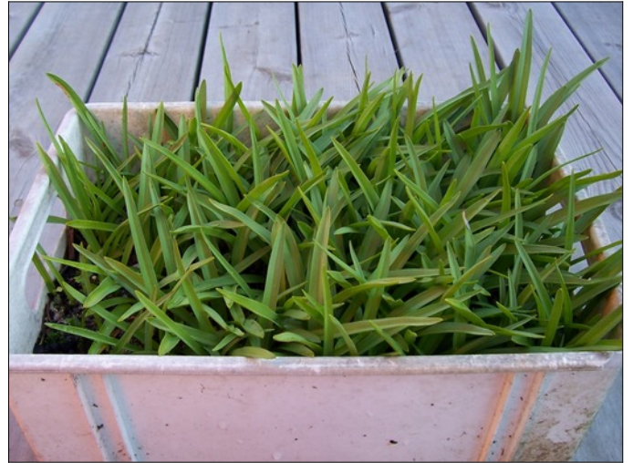
Dactylorhiza purpurella second year in soil. The plantlets now have 2-3 leaves.

Many ground orchids respond well to culture in sandy soil. The reason is probably that sandy soil has good drainage and it is open and well aerated. If you do not have sandy soil in your garden, you