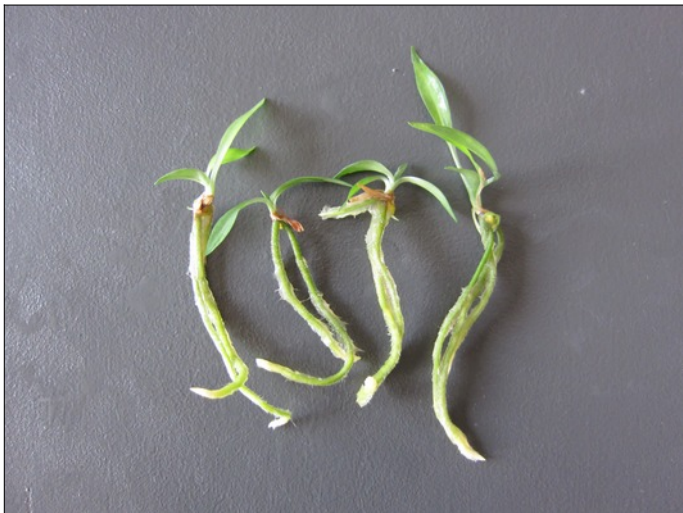
Out of the flask.