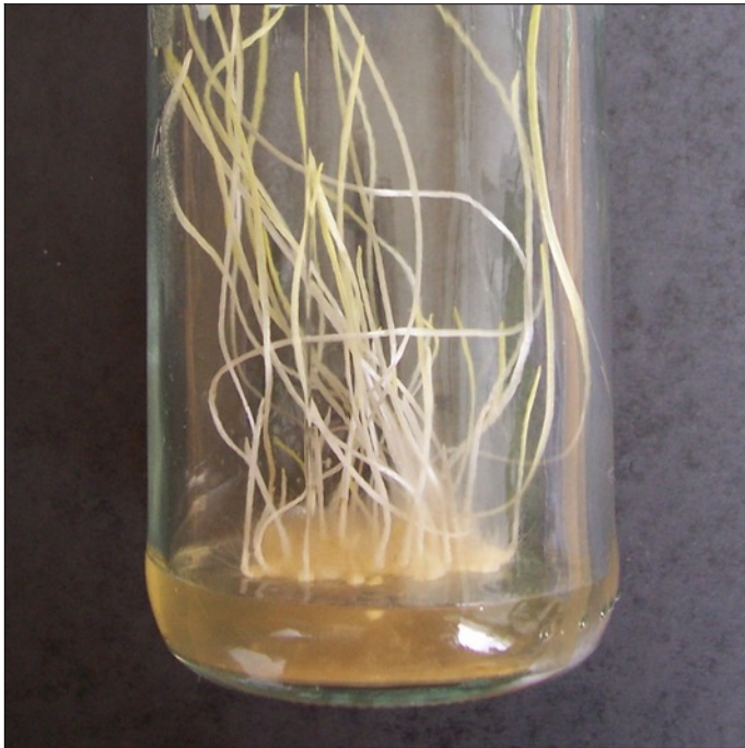
Dactylorhiza praetermissa protocorms with leaves developed in the refrigerator. They should have been replanted, but were forgotten in the refrigerator during summer.

If the seedlings are potted without chilling, they will simply remain dormant and wait for winter. Eventually they run out of energy and die. If the seedlings are kept longer in the fridge, they will often develop leaves during spring and summer, even in the dark.