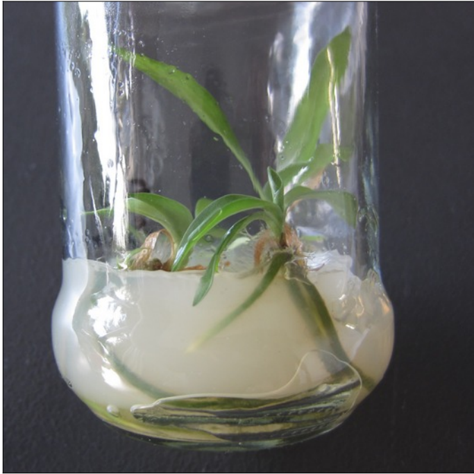
Spiranthes cernua in April after three months in the refrigerator.